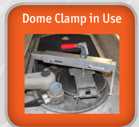
Dome Clamp in Use

A DQE exclusive, this dome clamp is unlike any other clamp in that its patented design is fully adjustable, yet fast to install. It features a unique offset pressure plate, rather than one that falls in the center of the tank valve area. This optimized, off-center placement of the pressure foot creates an ideal relation to the primary point of the leak flow to stop leaks fast.