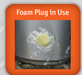
Foam Plug in Use