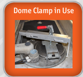
Dome Clamp in Use

A DQE exclusive, this dome clamp is unlike any other clamp in that its patented design is fully adjustable, yet fast to install. It features a unique offset pressure plate, rather than one that falls in the center of the tank valve area. This optimized, off-center placement of the pressure foot creates an ideal relation to the primary point of the leak flow to stop leaks fast.