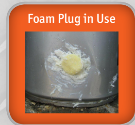
Foam Plug in Use