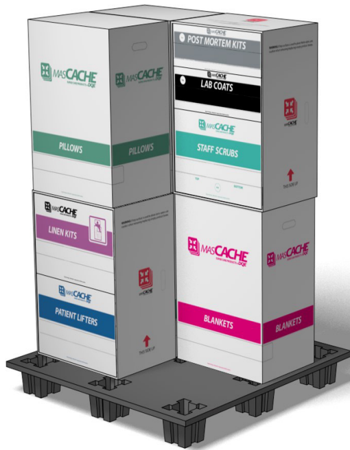
MasCache POD (MCPD4), (MCPD5), (MCPD6)