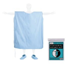
Don-it® Personal Privacy Kit HMDONIT|HMDONIT-Y|HMDONITBX|HMDONITBX-Y