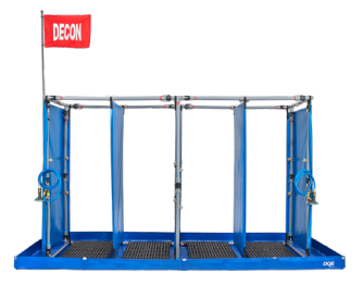
MasCas® II Decon Shower System HM4200|HMK4201