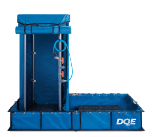
Standard Decontamination Shower System HMK1101A|HMK1101S